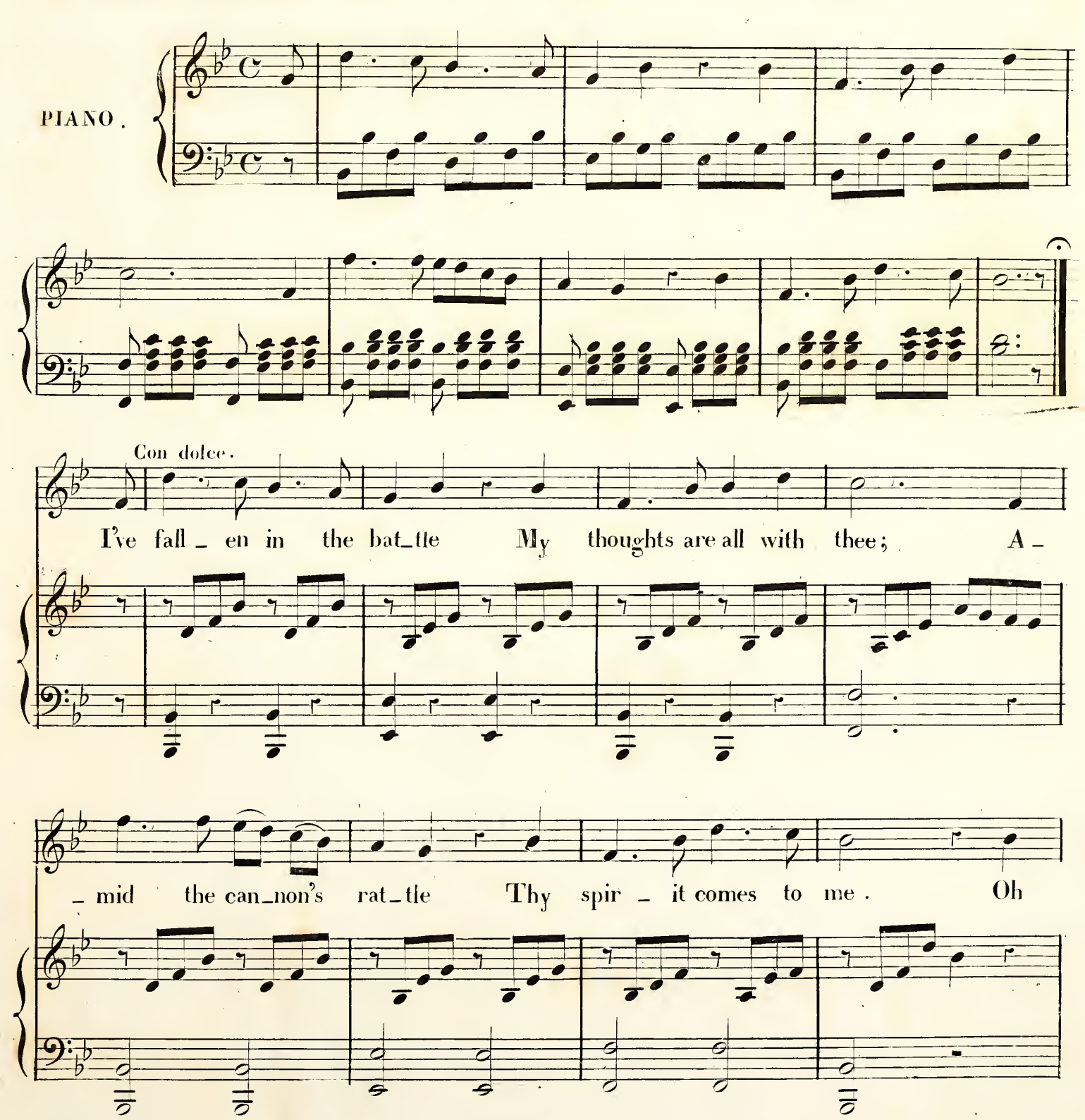
Entered according to Act of Congress AD 1864 by A.B. CHANDLER in the Clerk's Off. of the Dist. Court of the Dist. of Li.